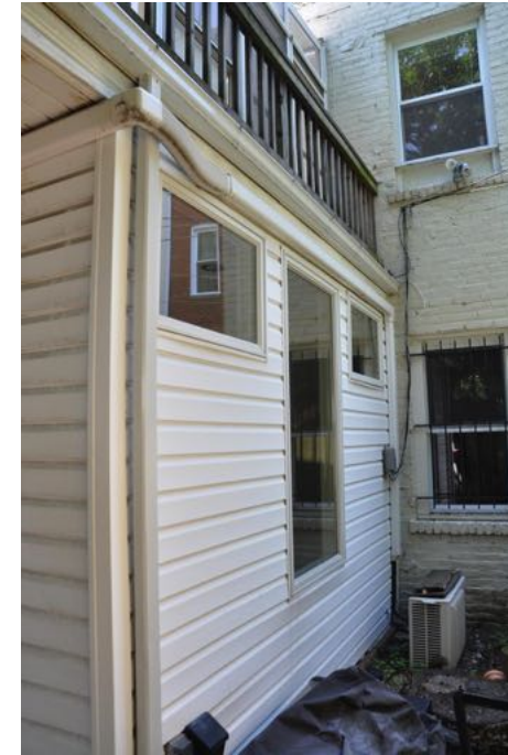
West Facade, Rear