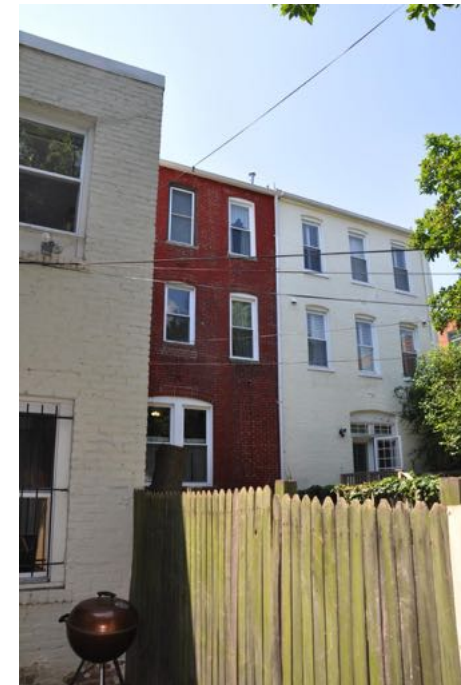
Rear of 1309 and 1311 S Street