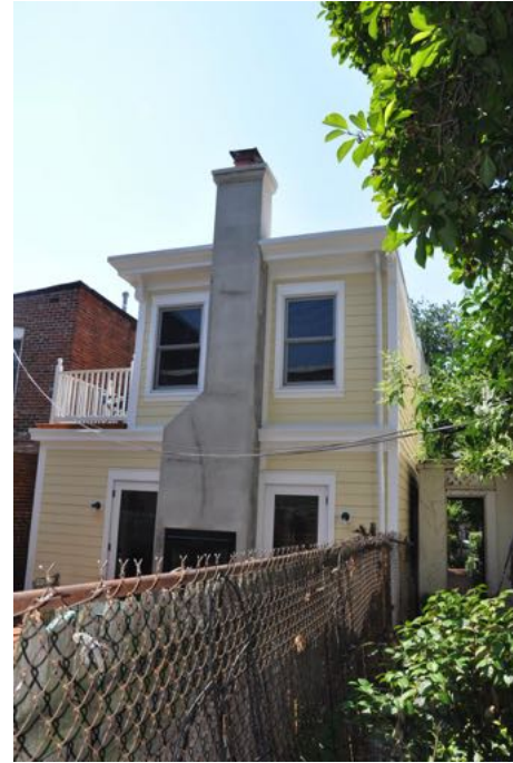
Rear of 1305 S