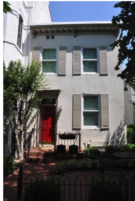
Front S Street Facade