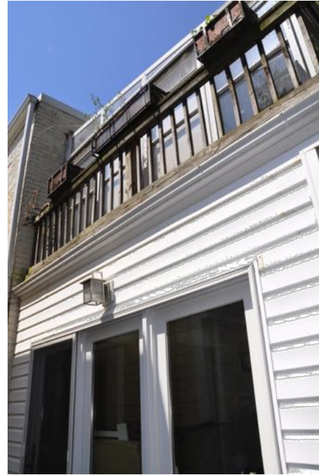
East Facade, Rear